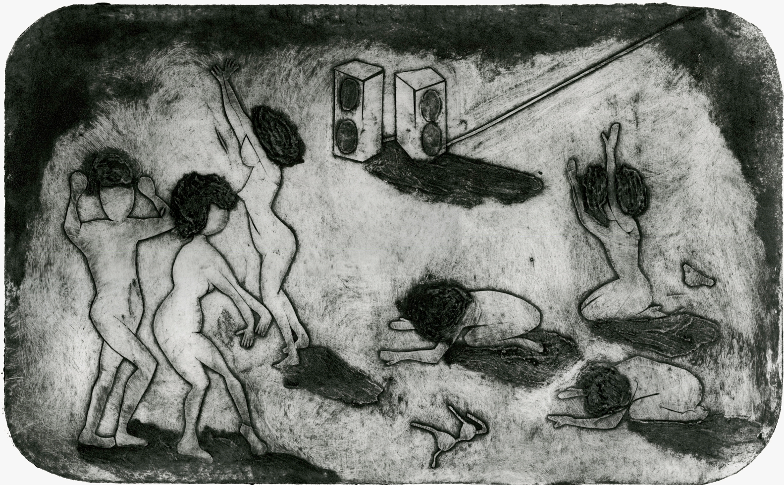
14. I Was 100% Yes, 30" x 22", collagraph, 2016.

Part of Vivianus , The Delaware Contemporary, Wilmington, DE.