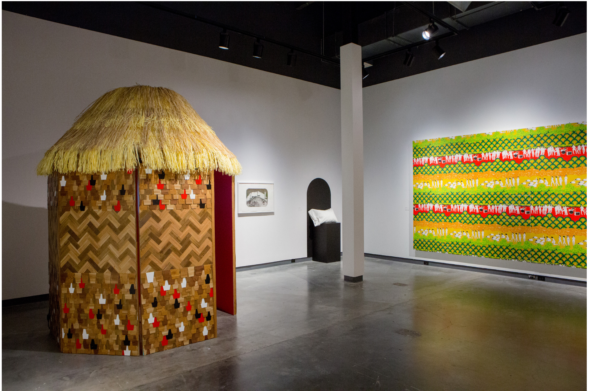
12. Vivianus (installation shot), 25' x 27' x 16', mixed media, 2016.

Vivianus , The Delaware Contemporary, Wilmington, DE.