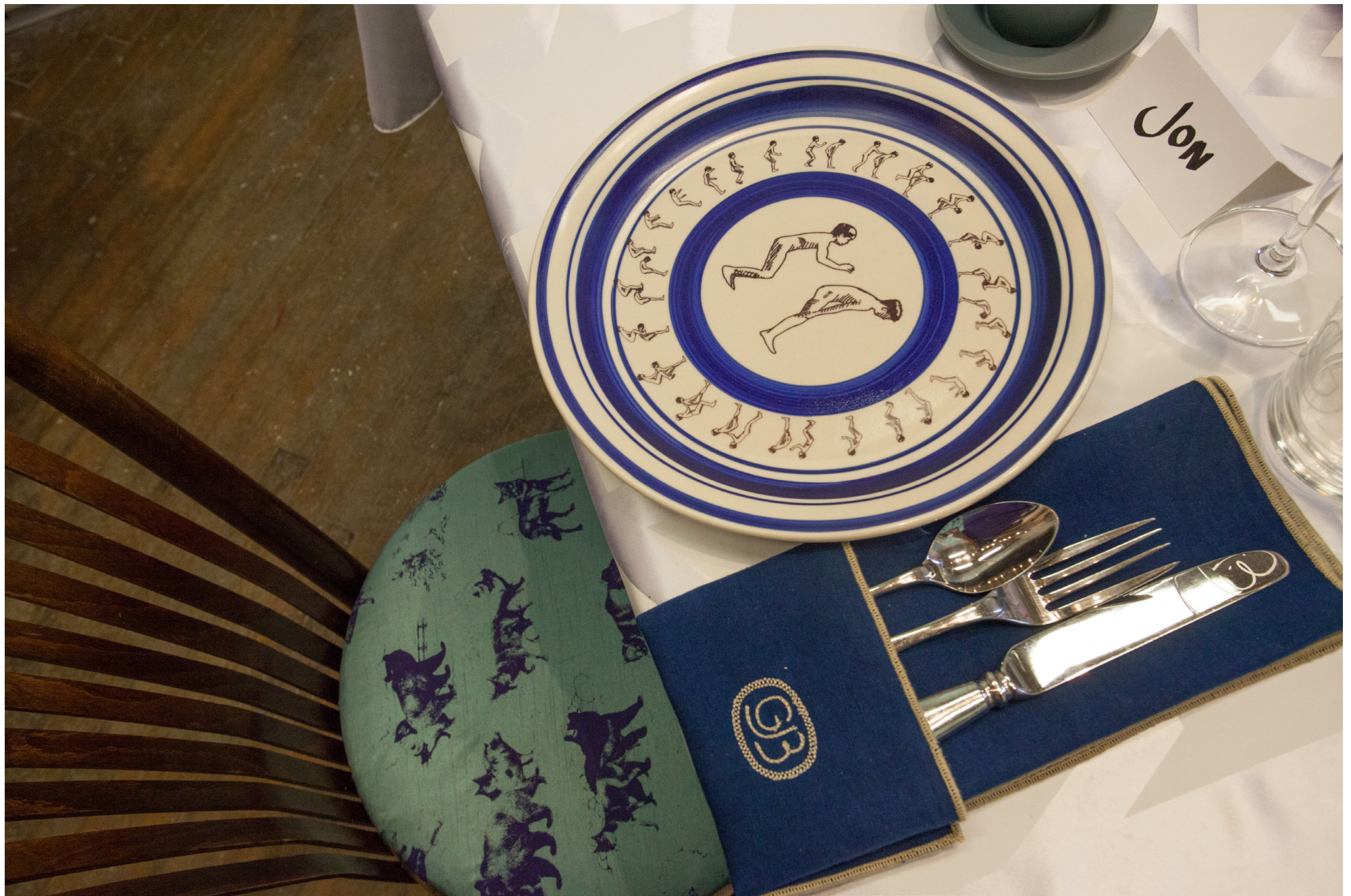
20. Leapfrog Plates (detail), 12" x 12", Stoneware and ceramic decals, 2014.