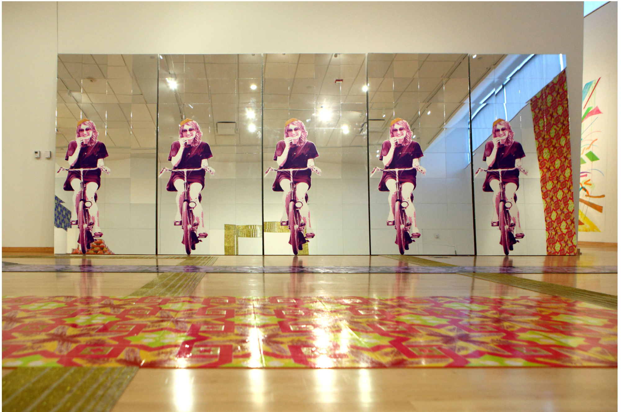
2. Yarmulke Girl, 8' x 20' x 2", mixed media: screenprints on mirror, foam, and wood, 2011.

Glitzianers , MFA thesis show, Temple Contemporary, Philadelphia, PA.