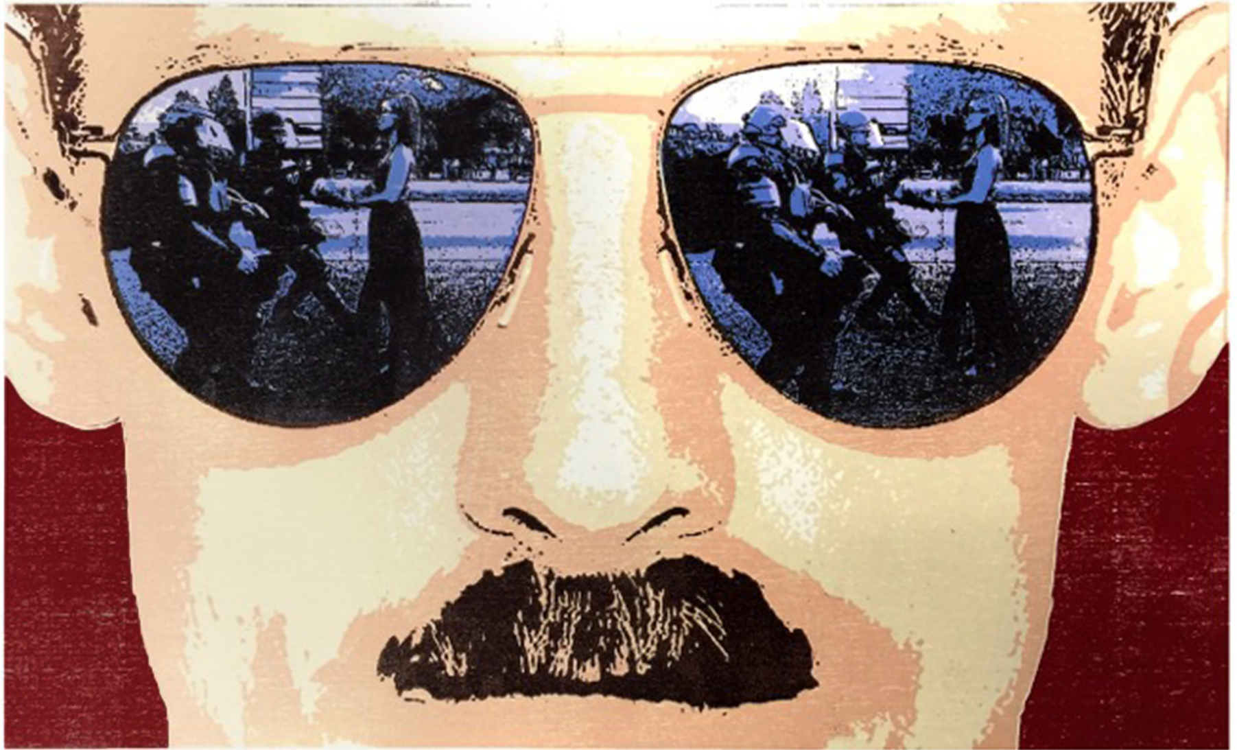
18. And the Home of the Brave, 20" x 15", laser woodcut, 2017.