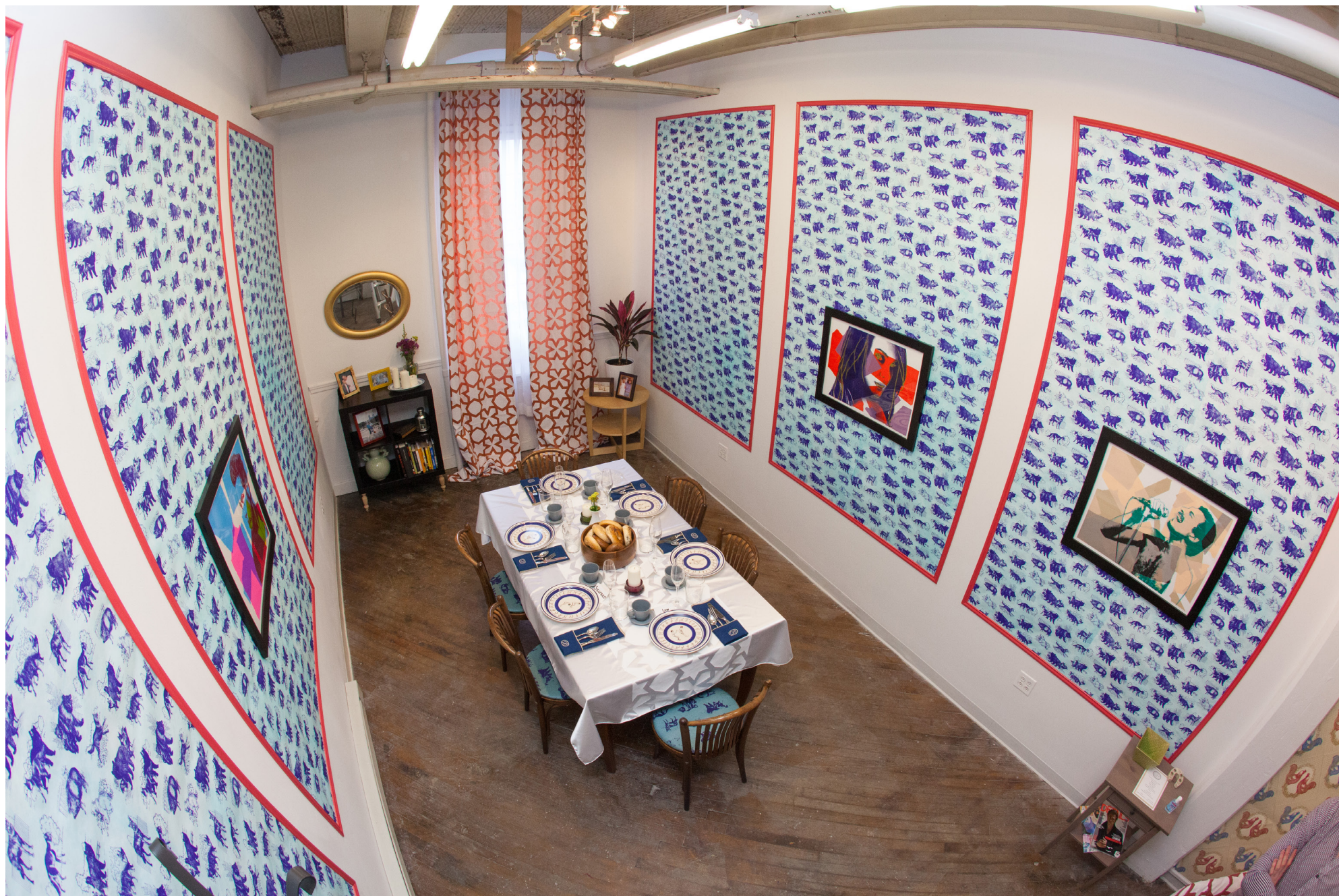
19. Gay, Jewish, or Both (installation shot), 10' x 15' x 22.5', mixed media: screenprints, Tyvek, paper, fabric, stoneware with ceramic decals, wood, paint, digital embroidery, etched glass, found photographs, found furniture and plants, 2014.

In collaboration with graphic designer Bernardo Margulis. Gay, Jewish, or Both , NAPOLEON, Philadelphia, PA.