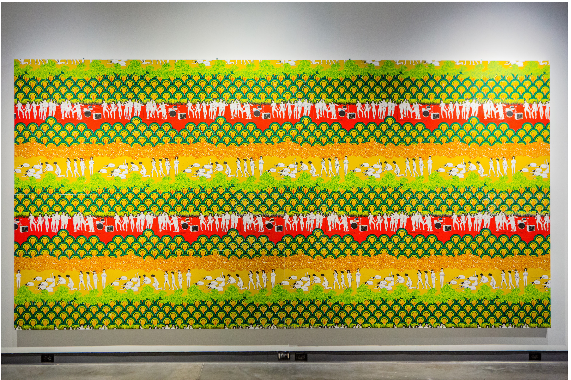
11. Seekers Become Finders, 8' x 16', mixed media panels: screenprints on Tyvek, wood, and paint, 2016.

Vivianus , The Delaware Contemporary, Wilmington, DE.