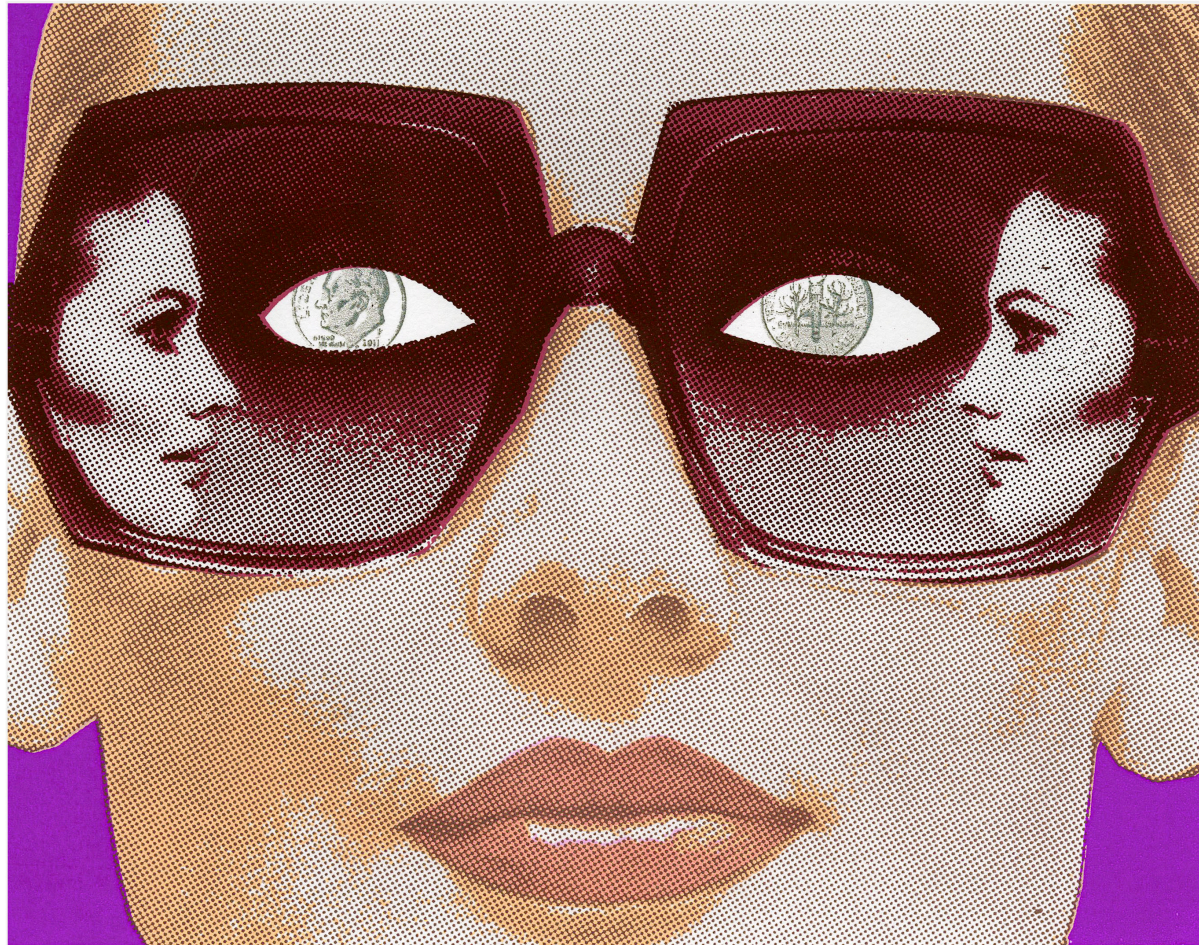
16. Dime, 10" x 12", screenprint, 2014.